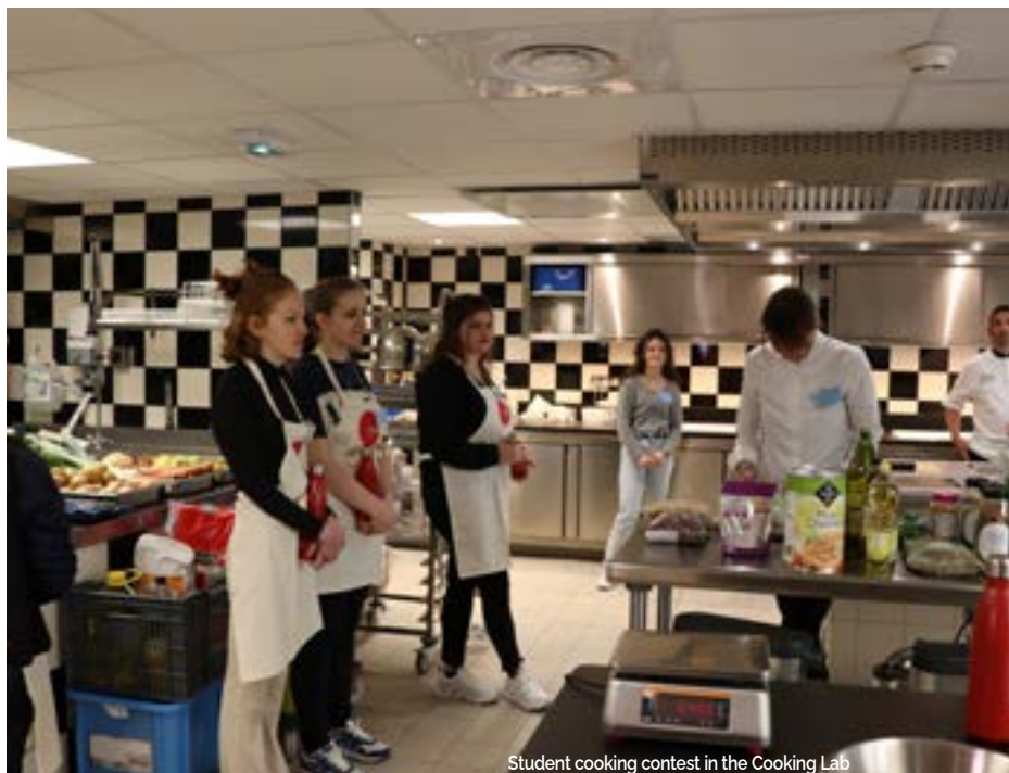
Student cooking contest in the Cooking Lab